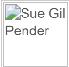
Sue Gil Pender