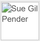
Sue Gil Pender