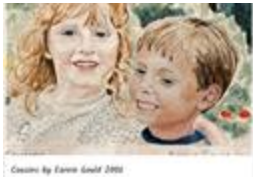
Created by Earnest Gould 2008