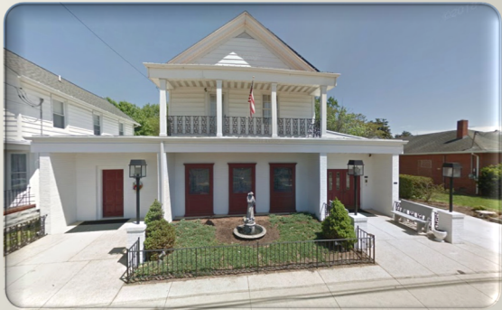
106 W. Sunset Ave. Greensboro, MD 410.482.8914