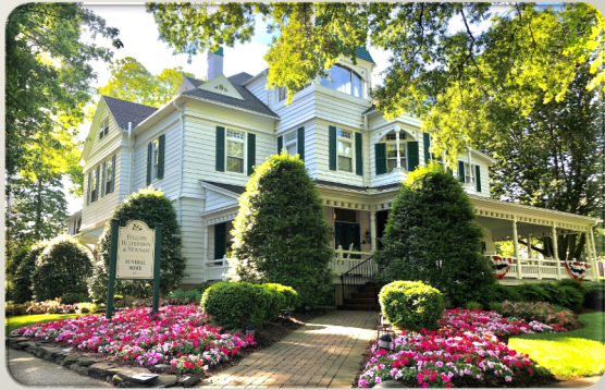
200 S. Harrison St. Easton, MD 410.822.3131