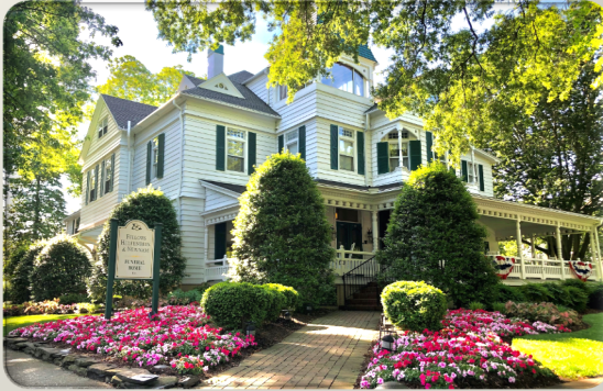
200 S. Harrison St. Easton, MD 410.822.3131