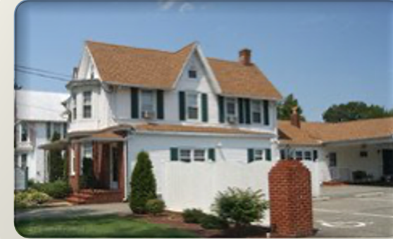
370 W. Cypress St. Millington, MD 410.928.5311