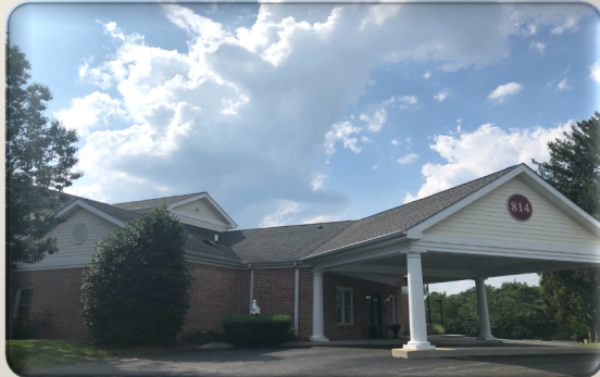
814 Bestgate Road Annapolis, MD 410.897.4852