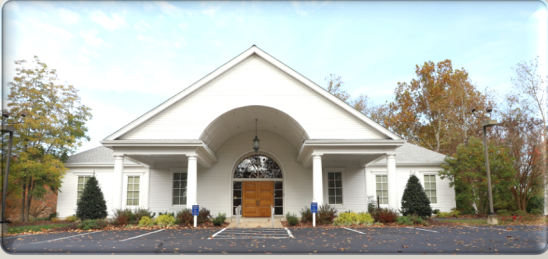
408 S. Liberty St. Centreville, MD 410.758.1151