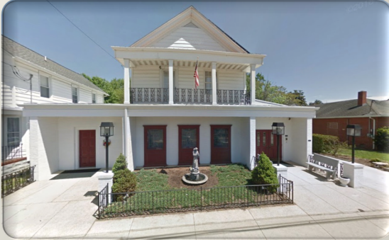
106 W. Sunset Ave. Greensboro, MD 410.482.8914