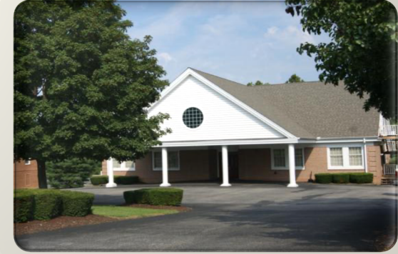
130 Speer Rd. Chestertown, MD 410.778.0055