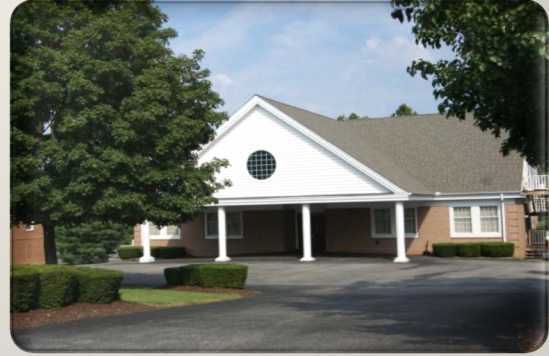
130 Speer Rd. Chestertown, MD 410.778.0055