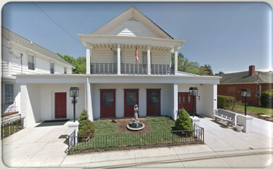
106 W. Sunset Ave. Greensboro, MD 410.482.8914