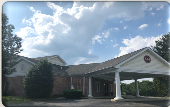
814 Bestgate Road Annapolis, MD 410.897.4852