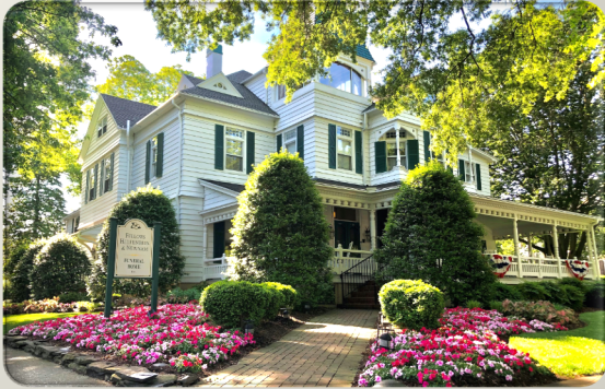
200 S. Harrison St. Easton, MD 410.822.3131