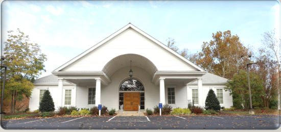
408 S. Liberty St. Centreville, MD 410.758.1151