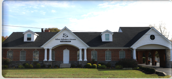
106 Shamrock Rd. Chester (Kent Island), MD 410.643.2226