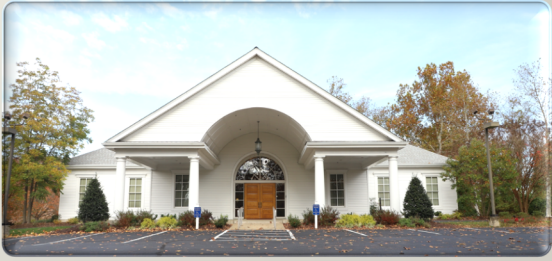
408 S. Liberty St. Centreville, MD 410.758.1151