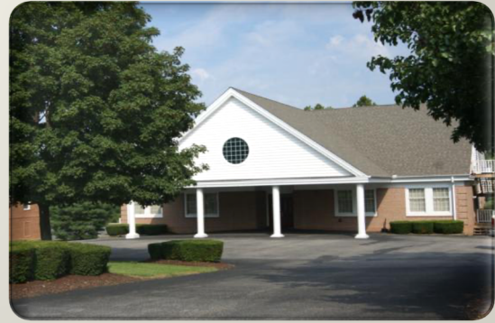
130 Speer Rd. Chestertown, MD 410.778.0055