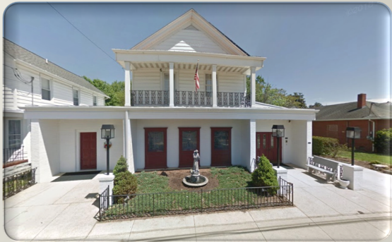
106 W. Sunset Ave. Greensboro, MD 410.482.8914