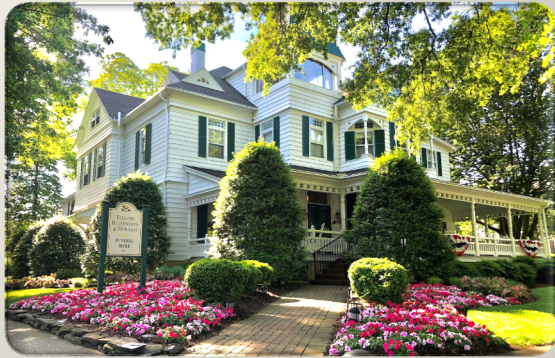
200 S. Harrison St. Easton, MD 410.822.3131