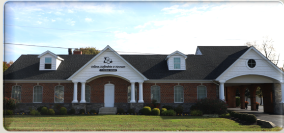
106 Shamrock Rd. Chester (Kent Island), MD 410.643.2226