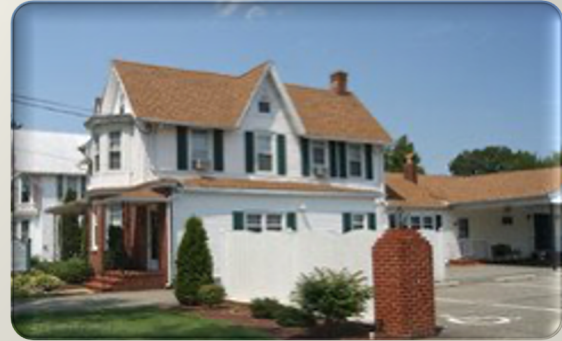
370 W. Cypress St. Millington, MD 410.928.5311