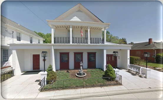
106 W. Sunset Ave. Greensboro, MD 410.482.8914